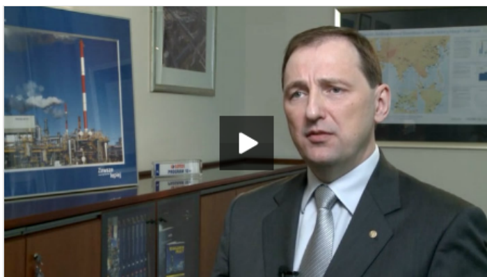
Program 10 + it is a foundation of the subsequent development

The value of the project also bespeaks its importance – approximately PLN 5.5bn was invested in equipment design, construction and procurement. The upgrade of the refinery, increase in its processing capacities and improved product quality have significantly strengthened the Company's market position, contributing to its record-breaking financial performance.